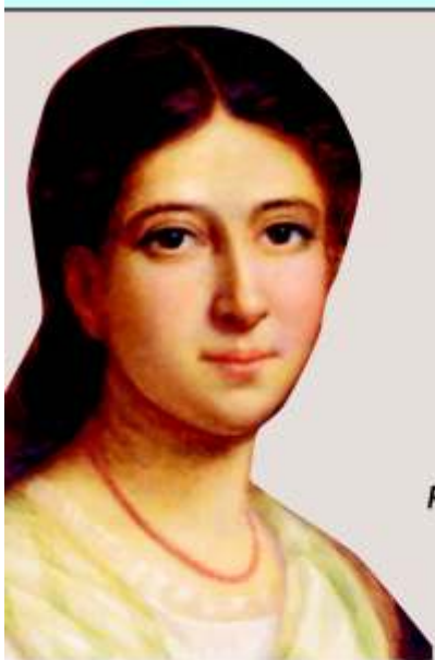
Pauline-Marie Jaricot (22/07/1799 to 09/01/1862) Foundress of SOCIETY OF THE PROPAGATION OF FAITH

The Pontifical Mission Society of the Propagation of Faith was founded by a young laywoman, Pauline Jaricot, in Lyons, France in 1822. In 1922, Pope Pius XI made it a Pontifical Society, to indicate its status as the Church's official institution for helping all missions in the world, a unique jewel of which we can be rightly proud. It is an institution, which is at the service of the Holy Father, the College of Bishops, and the whole People of God. The society coordinates missionary activity throughout the world, but it is also part of the local church that has the right and duty to "make disciples of all nations" (Mt 28:19)